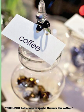
"THE LINDT balls came in special flavours like coffee."

Candy bar; mini crème brûlée in spoons presented on a tiered tower