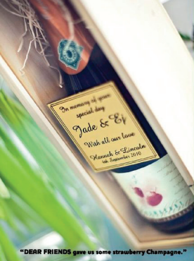
"DEAR FRIENDS gave us some strawberry Champagne."