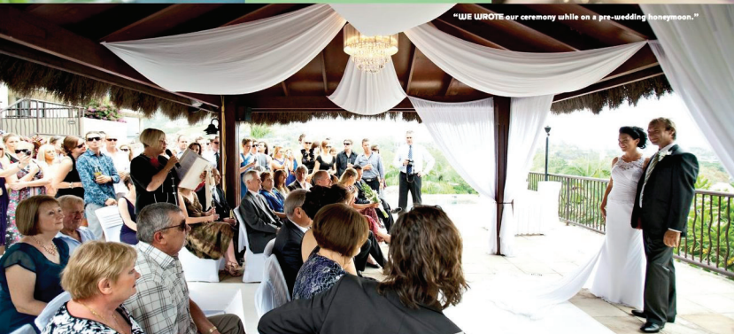
"WE WROTE our ceremony while on a pre-wedding honeymoon."