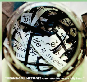
"MEANINGFUL MESSAGES were attached to the lolly bags."