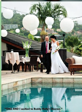
"DAD AND I walked to Buddy Holly's Decree."

"As my something blue I wore a glass blue bead in my hair, given to me by a friend"