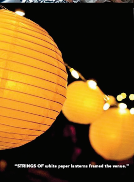
"STRINGS OF white paper lanterns framed the venue."