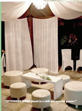
"OTTOMANS WERE placed in a chill-out area for guests."