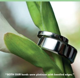
"BOTH OUR bands were platinum with bevelled edges."

An elegant pair celebrate their union overlooking the pristine waters of the Whitsundays